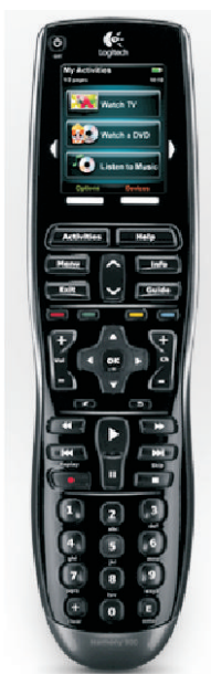
Harmony 900 remote

Direct IR control of A/V devices in the particular room